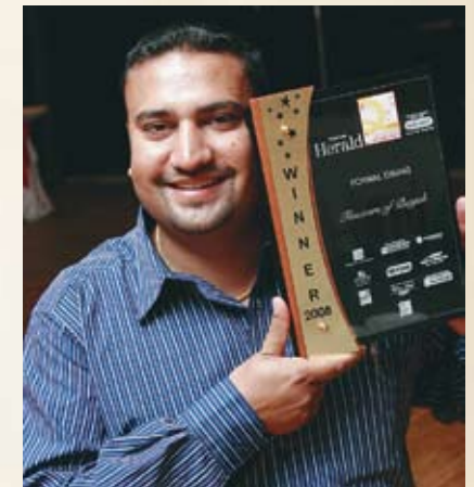
Winner Formal Dining 2008

196 Preston Road, Manly West (Next door to Knock Out Bakery)