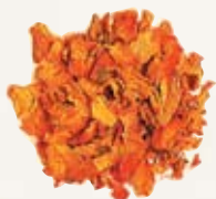
Dried Rose Pedals